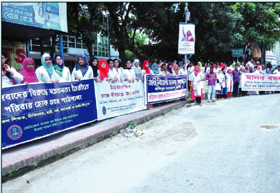
Procession Against Terrorism