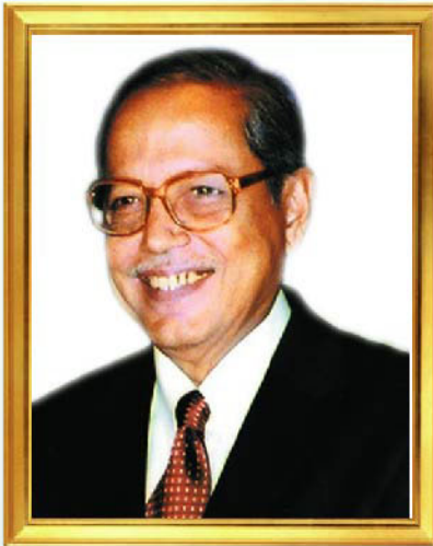
Prof. A.Q.M. Badruddoza Choudhury Chairman Board of Trustee

Former President, People's Republic of Bangladesh