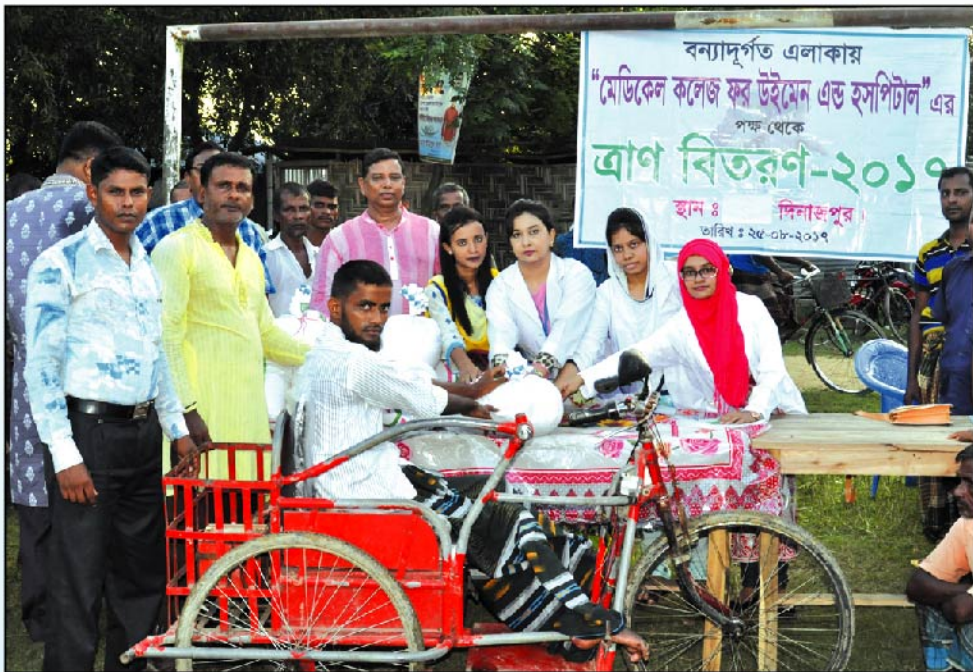
Relief work to the flood affected peoples at Dinajpur, Bangladesh.