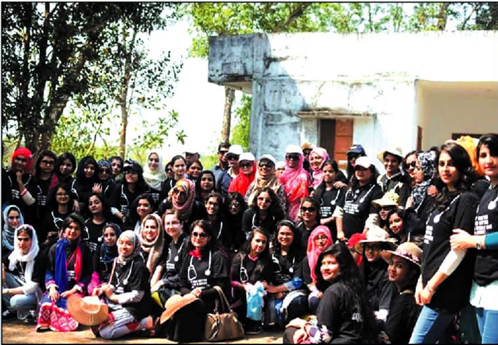
Study Tour-2017 (Srimangal, Sylhet)