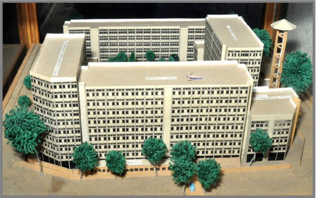
Proposed building of Uttarkhan General Hospital