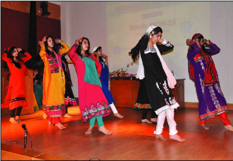
Cultural Program by foreign students