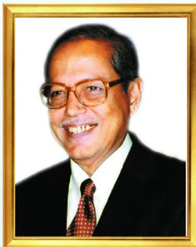
Prof. A.Q.M. Badruddoza Choudhury Chairman, BOT Former President, People's Republic of Bangladesh