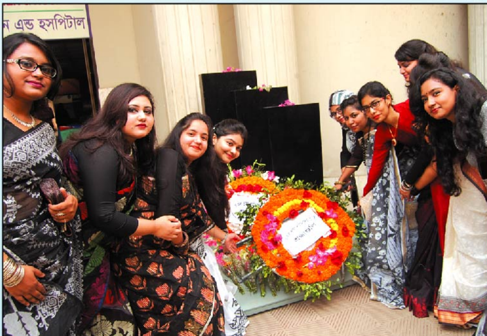
International Mother Language Day (21st February) 2017