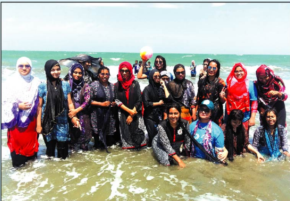
Study Tour-2017 (Cox's Bazar)