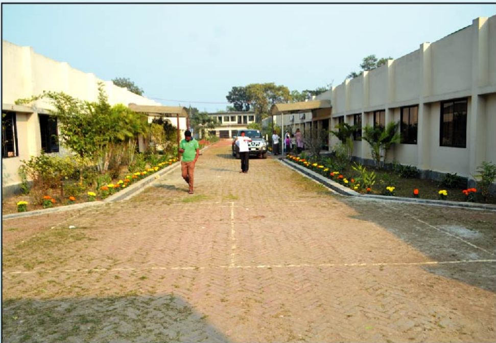
Uttarkhan General Hospital