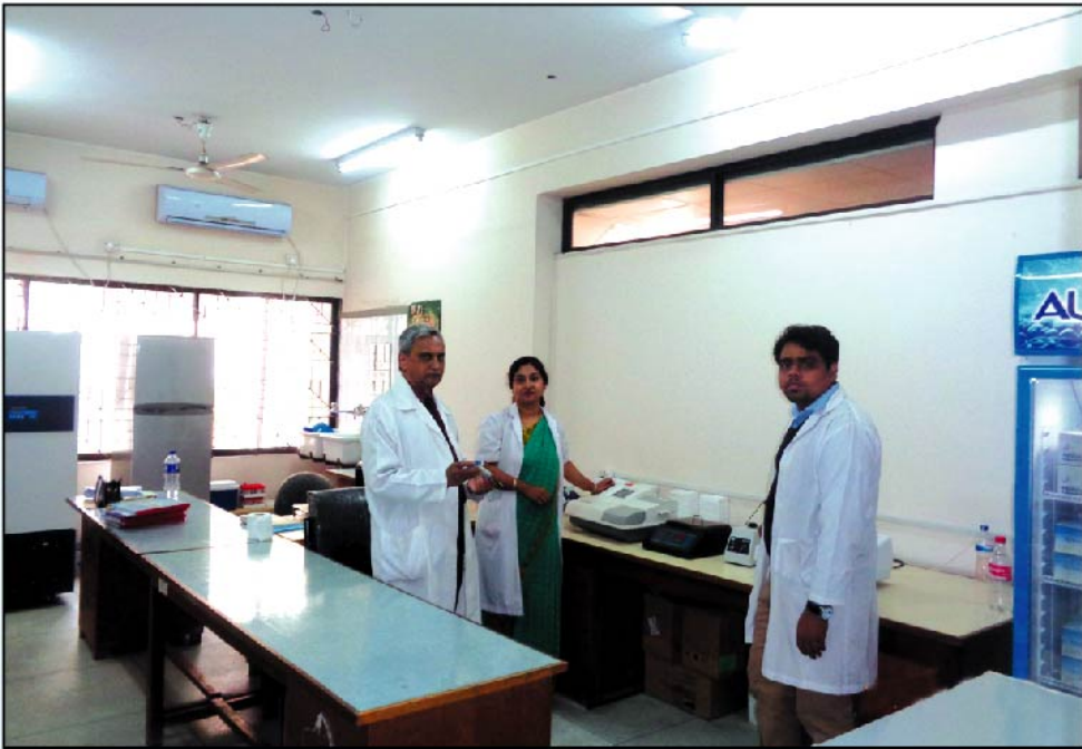
Medical Research Unit (MRU)