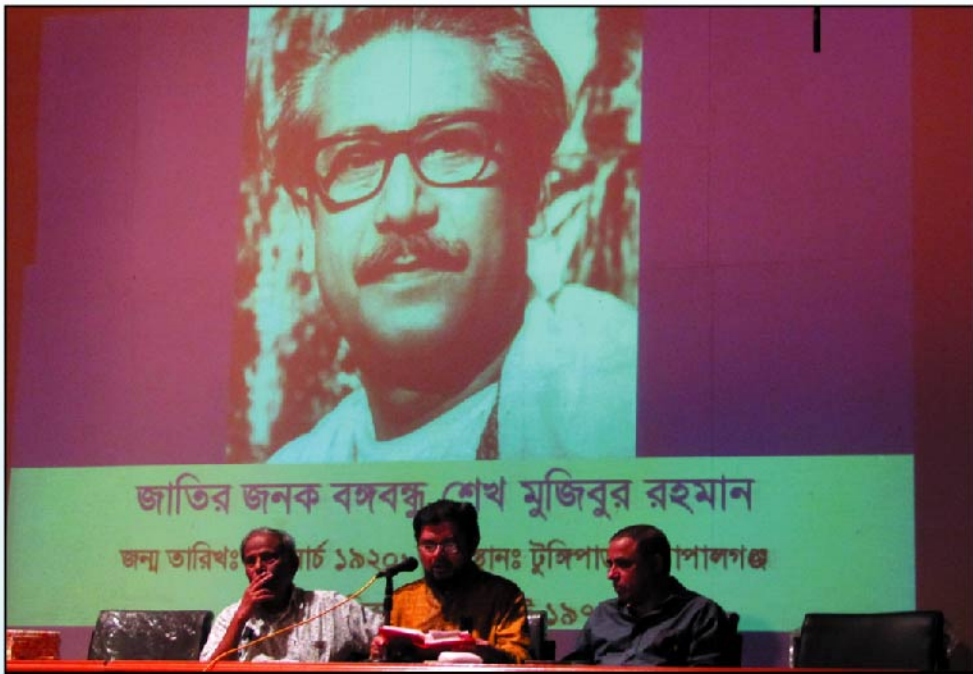
National Mourning Day (15th August) 2017