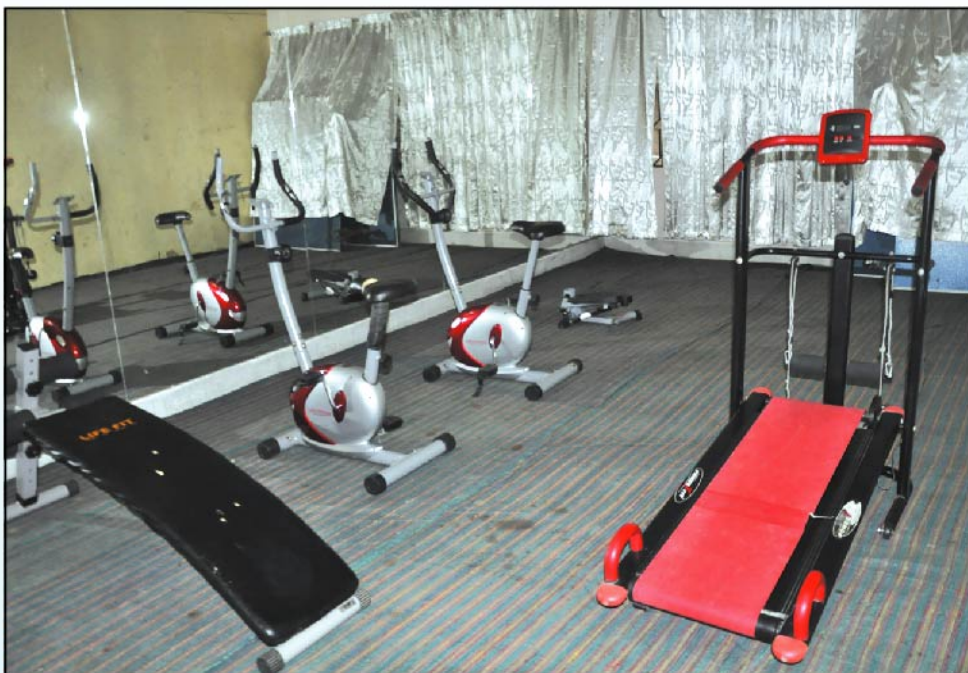
Gymnasium in Student's Hostel