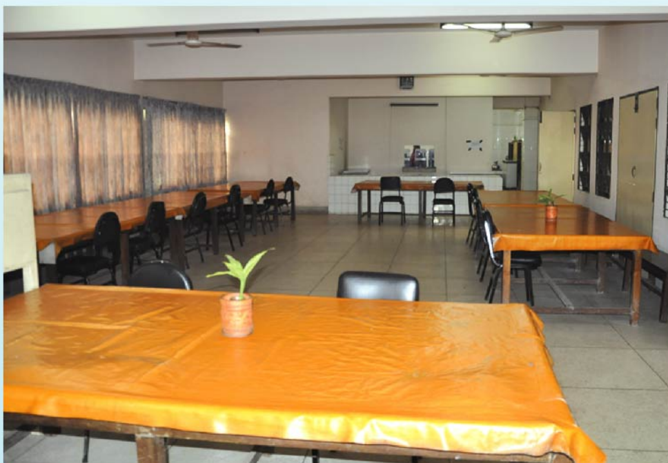
Dinning room in Student's Hostel