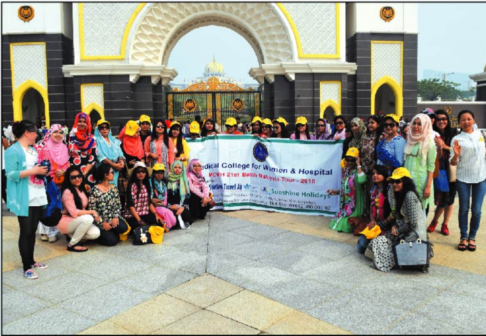
Study Tour 2016 (Malaysia)