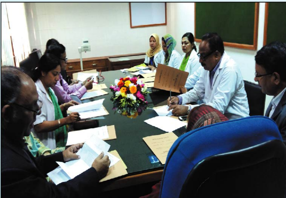
Medical Education Unit (MEU)