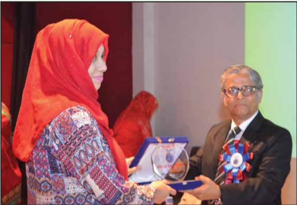
Award Given by Honorable Vice Chancellor, Dhaka University