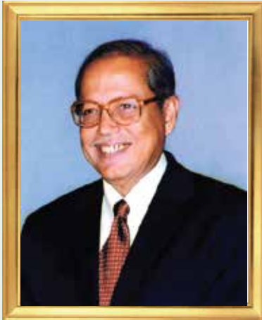
Prof. A.Q.M. Badruddoza Choudhury Chairman Board of Trustee Former President, People's Republic of Bangladesh