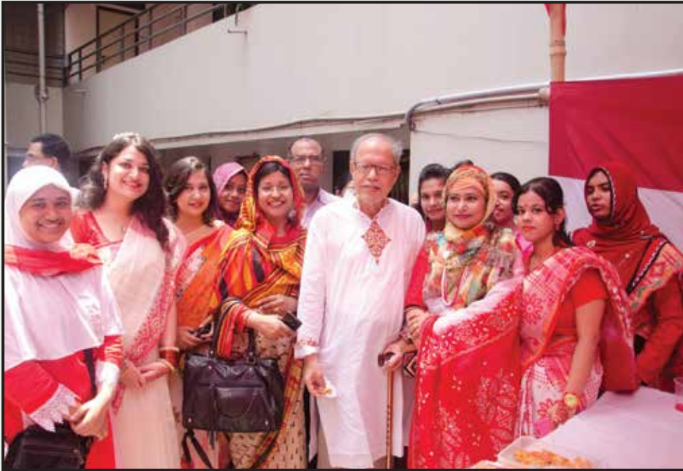
Bangla New Year