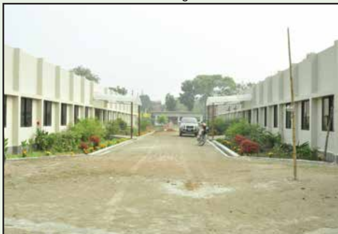
Uttarkhan General Hospital