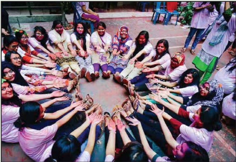
Event on 25th Year Celebration