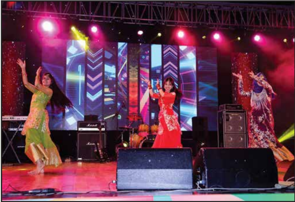
Students Performing in Grand Finale