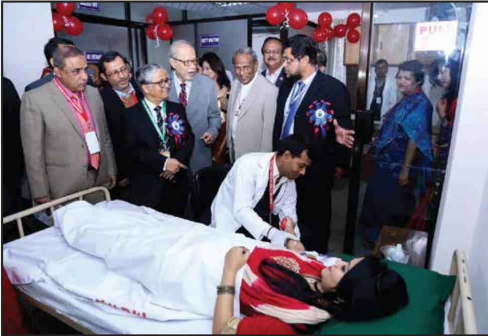
Blood Donation Program