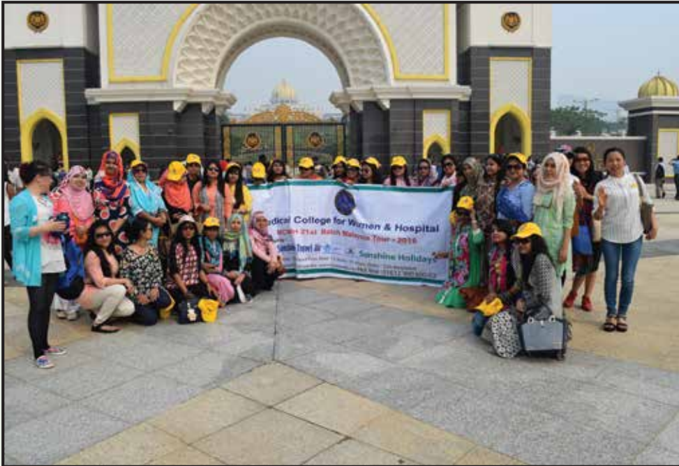
Study Tour at Malaysia