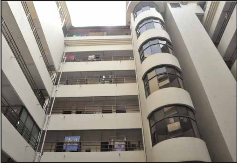
Main Hostel building