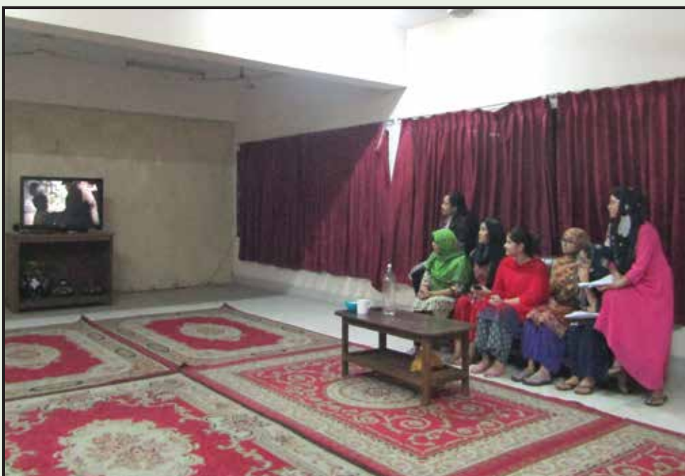
Hostel TV room