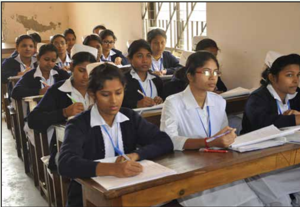
Nurse Student's class