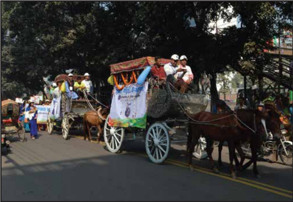
Rally on 25th year Celebration