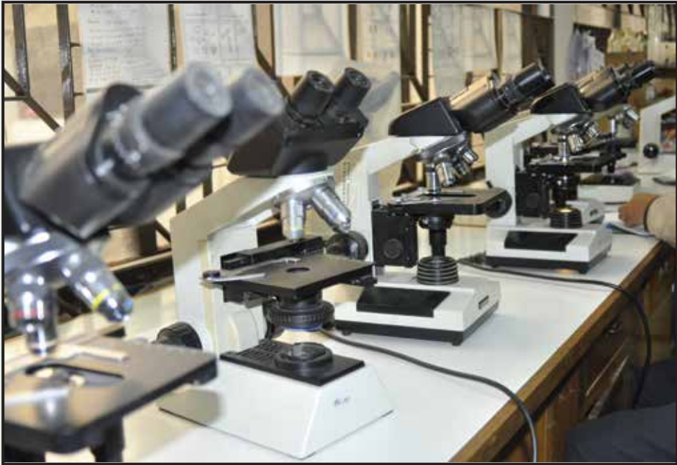
Modern Microscopes in Pathology Lab