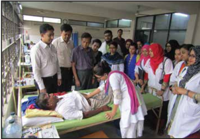
Students in Clinical (Ward) Class