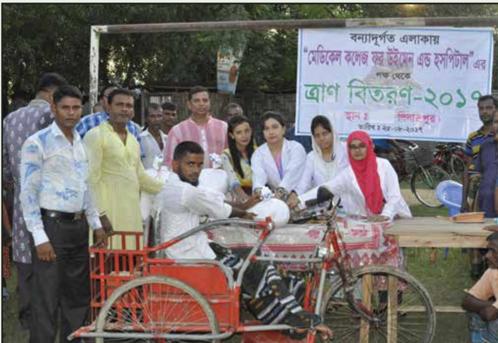
Relief Giving to Flood Affected People