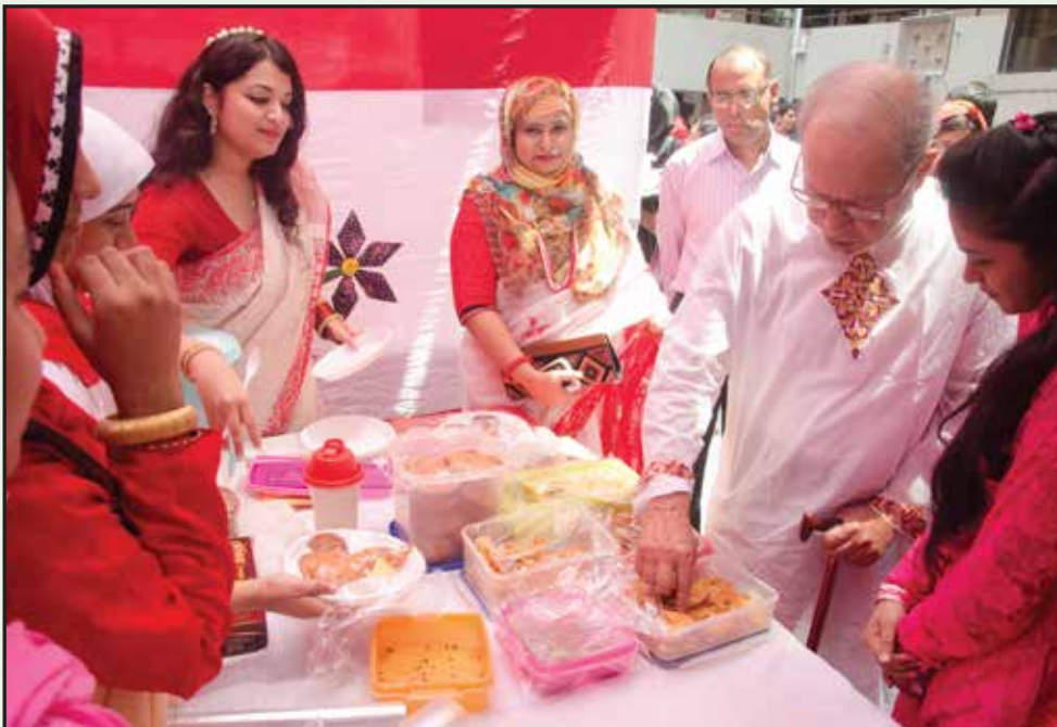
Bangla New Year