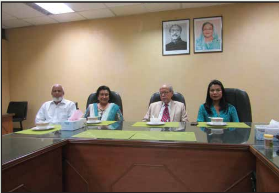
Board of Trustee Meeting