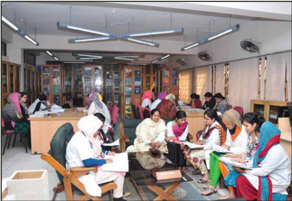
Air Conditioned Library