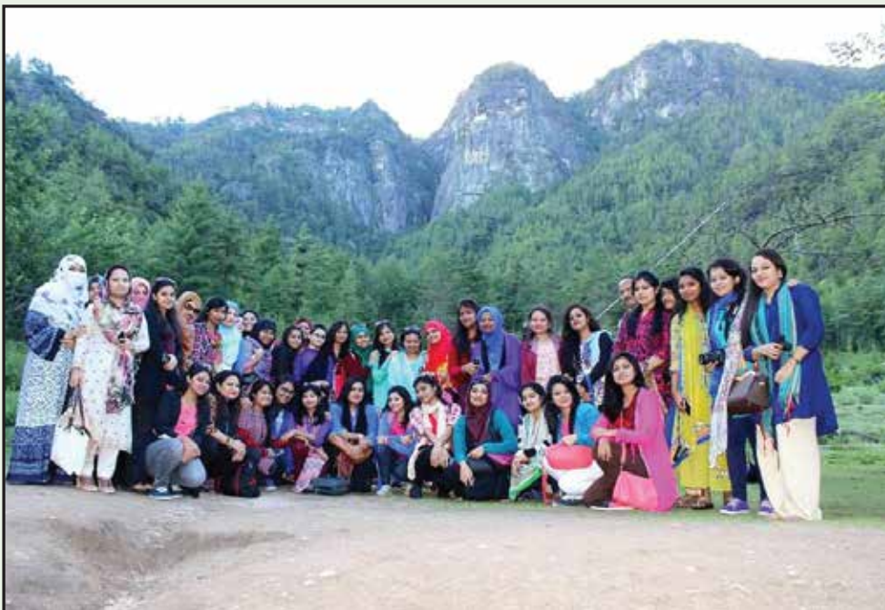
Study tour at Bhutan