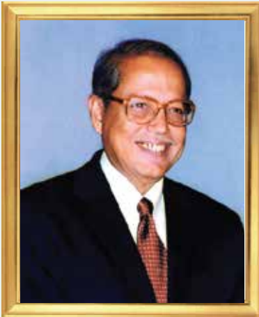
Prof. A.Q.M. Badruddoza Choudhury Chairman, Board of Trustee Former President, People's Republic of Bangladesh