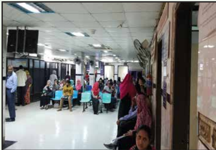
OPD Waiting Area