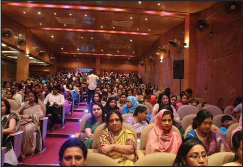
Prof. Suraiya Jabeen Auditorium