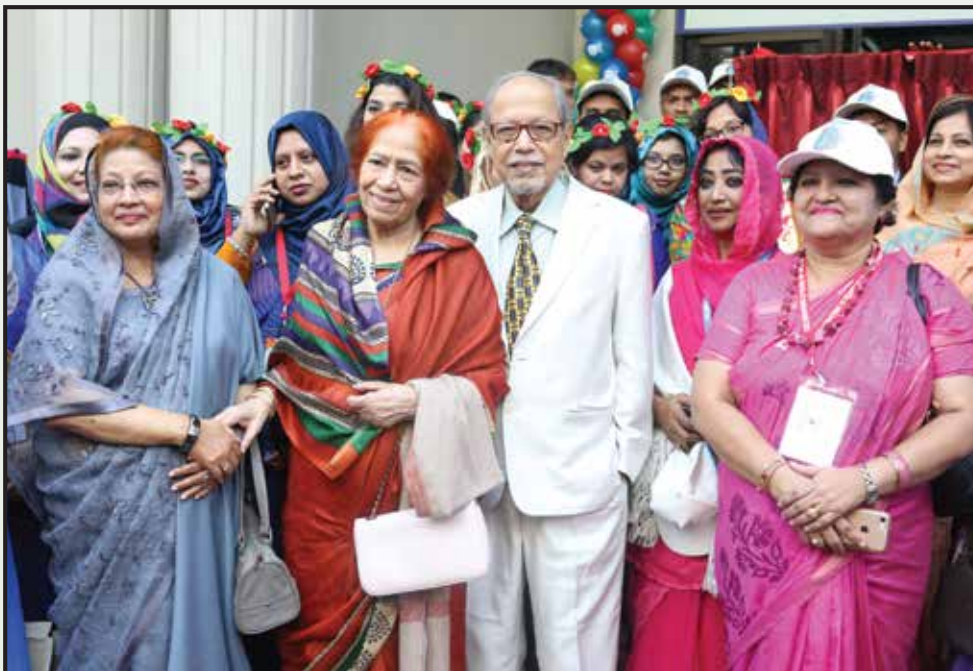
25th Year Celebration Program